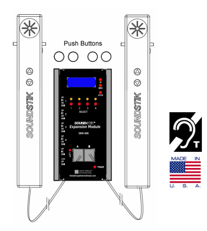
Mode 1: One handset Plays 1 - 4 mp3 files

Woman Owned Small Business SAM Active ECCN: EAR99 25 Van Zant Street, Unit 14-7B, Norwalk, CT 06855 US Toll Free: 1.800.866.2113 TEL: +1.203.852.5557 FAX: +1.203.852.5559